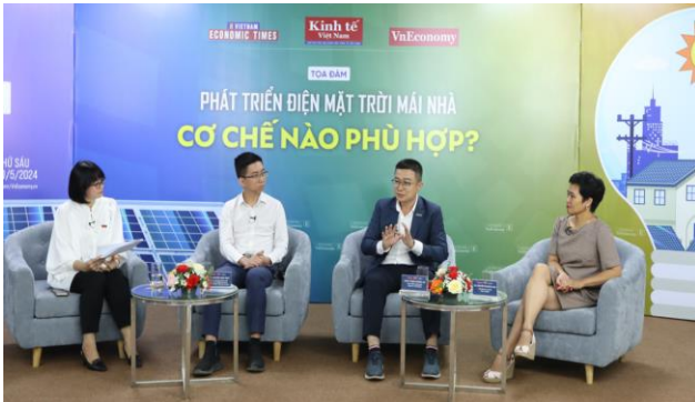
“Rooftop Solar Development: Which is the suitable mechanism?” Webinar