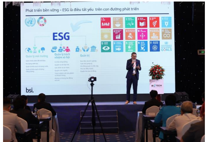
BizTech Vietnam 2024: Digital and Green Transformation, Towards a Sustainable Growth