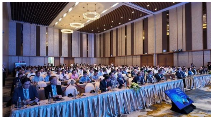
2024 Southeast Asia Iron and Steel Institute (SEASI) Conference and Exhibition

*Hold down the Ctrl key and click the link to automatically open the article in a new tab