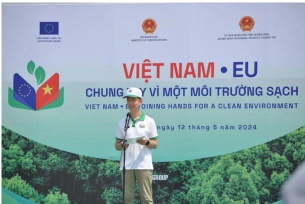
Vietnam, EU join hands for clean environment